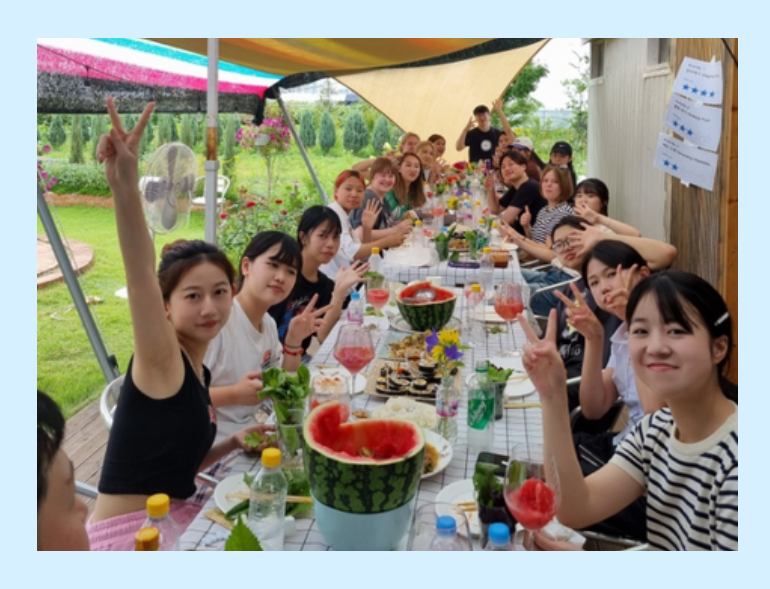
Korean traditional games and Food