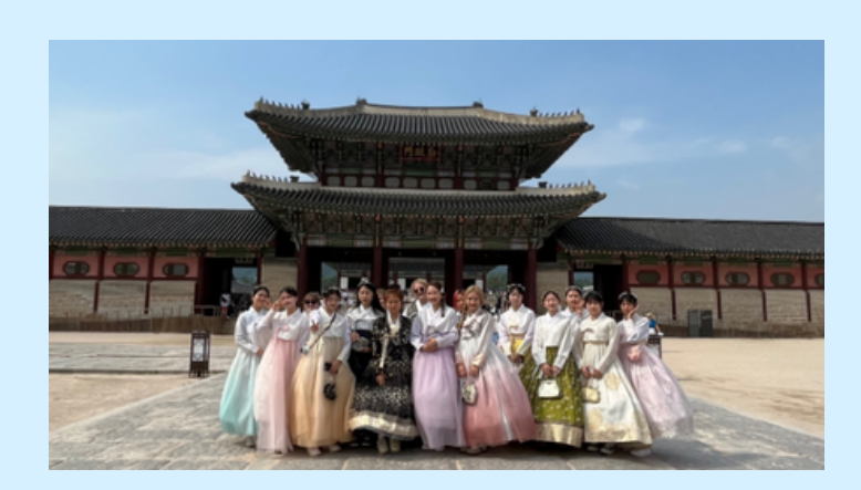
Hanbok experience in the Old Royal Palace