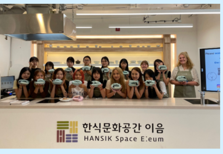
Korean Cooking Class